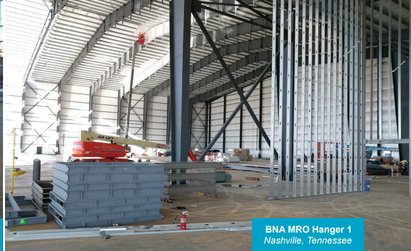
BNA MRO Hanger 1 Nashville, Tennessee