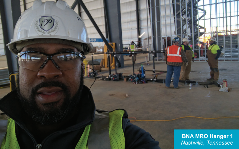
BNA MRO Hanger 1 Nashville, Tennessee